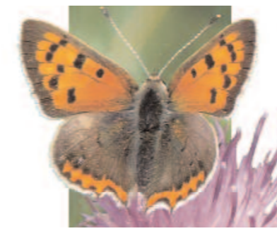
Small Copper ( Lycaena phlaeas )