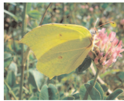
Brimstone ( Genepteryx rhamni )