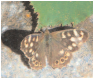
Speckled Wood ( Pararge aegeria ) © C O'Connell