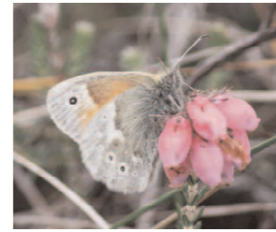
Large Heath ( Coenonympha tullia )