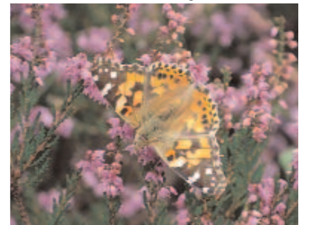
Painted Lady ( Cynthia cardui )