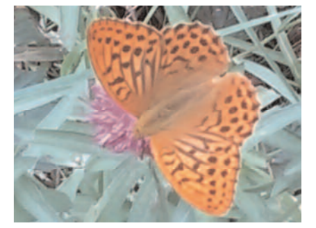
Silver-washed Fritillary ( Argynnis paphia )