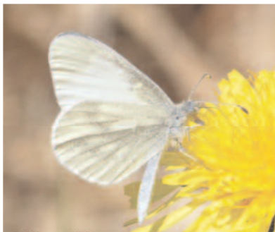
Wood White ( Leptidea sinapis )

Butterflies like open, sunny and sheltered places with lots of variation in the habitats present - such as mature or tall trees, some dense undergrowth, sunny glades, patches of recently cleared ground and regenerating open wildflower grassy areas. This diverse structure creates the variety of habitats necessary for