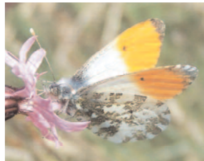
Orange-tip ( Anthocharis cardamines)