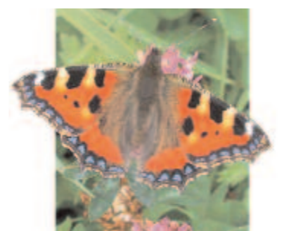
Small Tortoiseshell ( Aglais urticae )