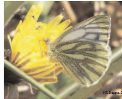
Green-veined White ( Artogeia napi )