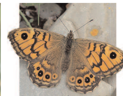
Wall Brown ( Lasiommata megera ) © R Duggan