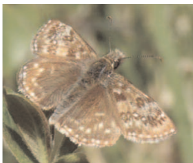
Dingy Skipper ( Erynnis tages )