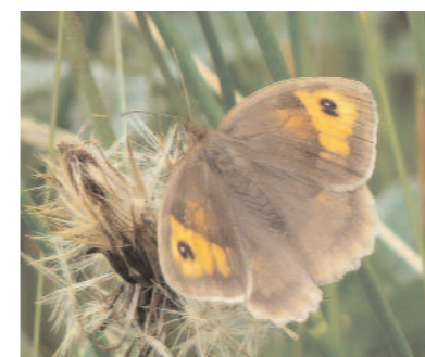
Meadow Brown ( Maniola jurtina)