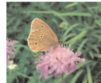
Ringlet ( Aphantopus hyperantus )