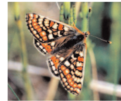
Marsh Fritillary ( Euphydryas aurinia)