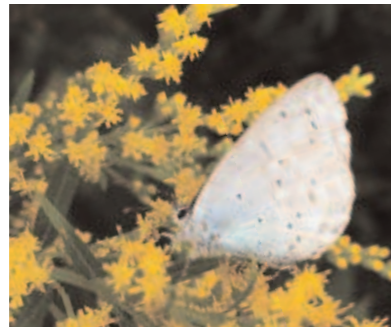
Holly Blue ( Celastrina argiolus )