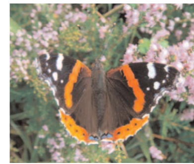
Red Admiral ( Vanessa alalanta )