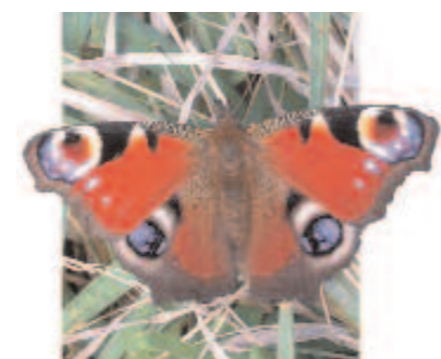
Peacock ( Inachis io )