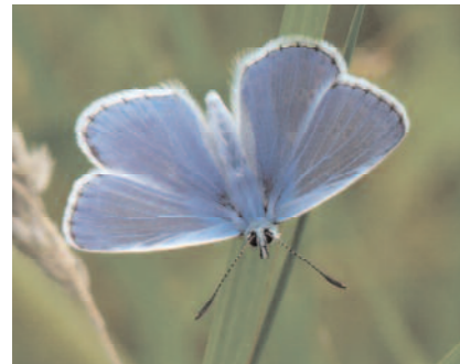
Common Blue ( Polyommatus icarus ) © T Ó Corcora