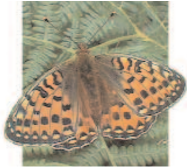
Dark Green Fritillary ( Argynnis aglaja)

Butterflies of Lullymore West Bog. How many have you seen?