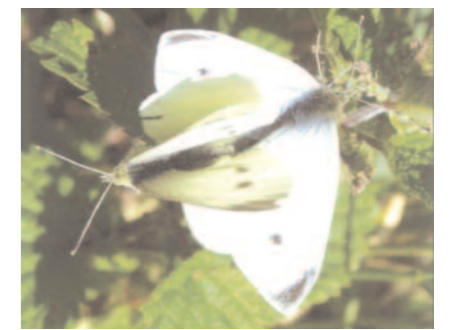
Small White ( Pieris rapae )