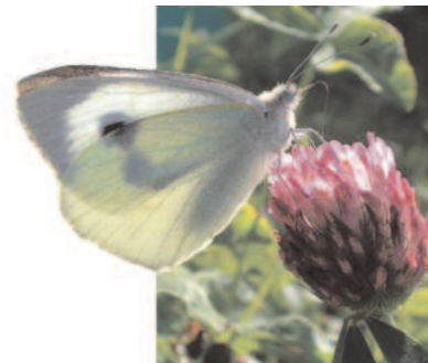
Large White ( Pieris brassicae )