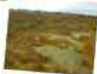
Feel the ground move on Clara Bog