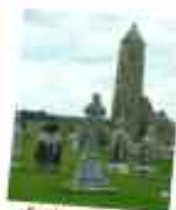
Explore early Christian graveyards at Gohennacree

TO BOOK YOUR PLACE CONTACT 045-860133 OR E-MAIL bogs@ipcc.ie