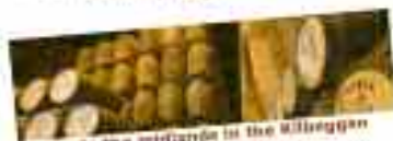
Taste the midlands in the Kilbeggan Whiskey Distillery