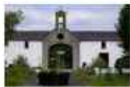
Explore the Bog of Allen Nature Centre