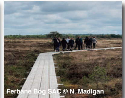
Ferbane Bog SAC

May and June was a busy time for IPCC facilitating peatland educational visits both at the Bog of Allen Nature Centre and through outreach. At Mount Lucas Wind Farm the IPCC presented bogland workshops with primary schools across five days. The IPCC guided students from Gallen Community School to their communities newly opened boardwalk on Ferbane Bog SAC. An information stand