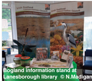
Bogland information stand at Lanesborough library