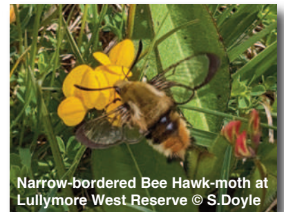
Narrow-bordered Bee Hawk-moth at Lullymore West Reserve

The Narrow-bordered Bee Hawk-moth ( Hemaris tityus ) is a day-flying moth that looks a bit like a bee! It is found on unimproved, damp grassland where it's larval foodplant, Devil's-bit Scabious, grows. Eggs are laid on the underside of scabious leaves, and the larvae develop from July to August, before overwintering as a pupa. Adults fly in May and June and hover as they feed on nectar from flowers such as Bird's-foot-trefoil.