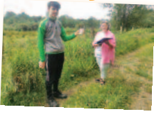
Volunteers monitoring bumblebees on Lullymore West

With support from Kildare County Council, IPCC have started a weekly 1 hour survey with the help of volunteers over 26 weeks, to monitor bumblebees on Lullymore West. The aim is to build confidence with identification and for the development of a long-term bumblebee monitoring survey on the site. 21 species of bumblebees are found in Ireland and so far we have recorded 34 bumblebees from five different species.