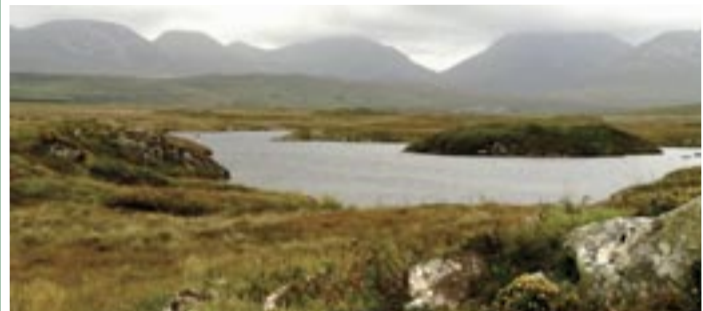
Save an Acre of Bogland Support IPCC's mission to purchase endangered and unique peatlands. Purchase a symbolic share in 1/16th acre of bog and receive a certificate to commemorate your work in saving Irish bogs. €45 (PC116)

Help Restore a Bog. Stop damaged bogs leaking greenhouse gases into the atmosphere. Your donation will be used to block drains, monitor water levels in bogs and undertake Sphagnum moss transplantation. €50 (PC161)